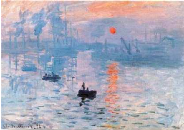
'Impression, Sunrise', Claude Monet 1